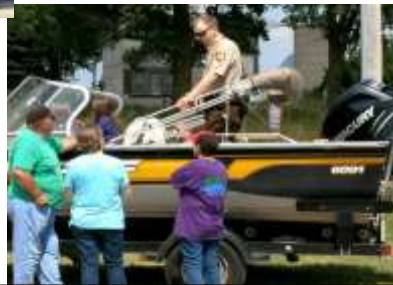
Crow Wing County Sheriff's Dept. Water Rescue