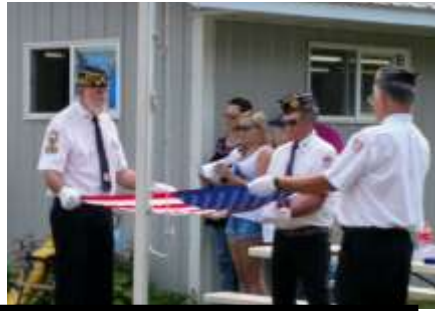
Hillman American Legion, Flag folding presentation, and raising of the U.S. Flag and MN State Flag