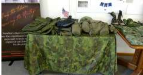
Camp Ripley Military Museum Traveling Trunk of World War II Military Artifacts.