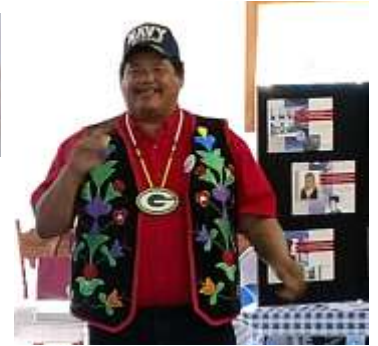
Mille Lacs Band of Ojibwe Military Presentation