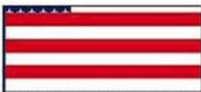
1. To fold the flag correctly, bring the striped half up over the blue field.