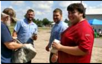
Pine Center Tire Crew