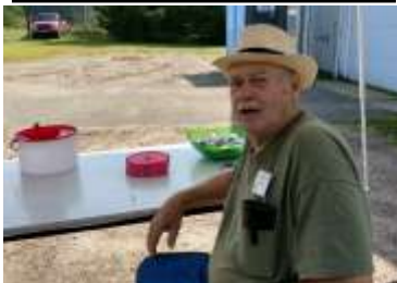
Giving tickets for Prize Drawings