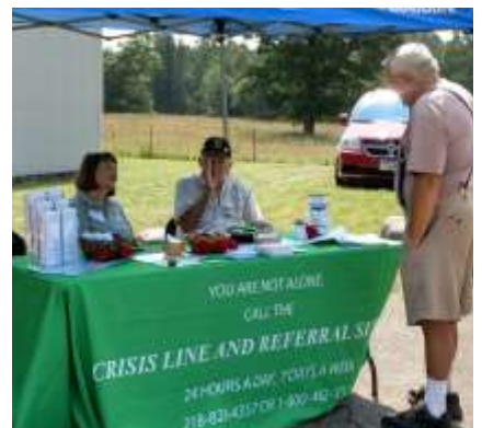
Crisis Line & Referral Service