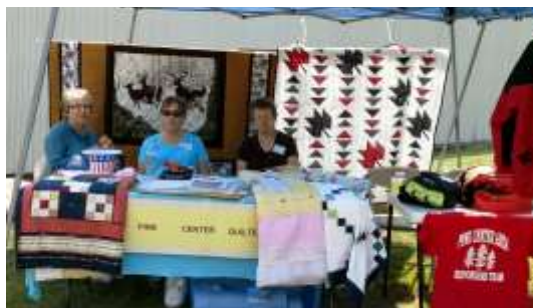
Pine Center Quilters & First Responders