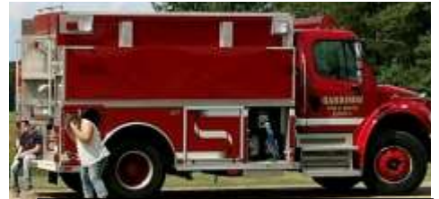
Garrison Fire & Rescue